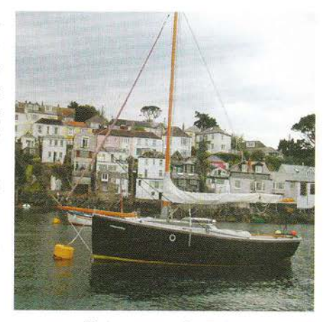
Shrimper moored in Polruan