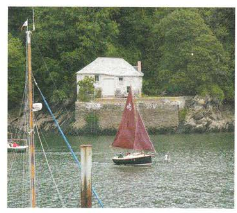
The Duchy leads the sail past