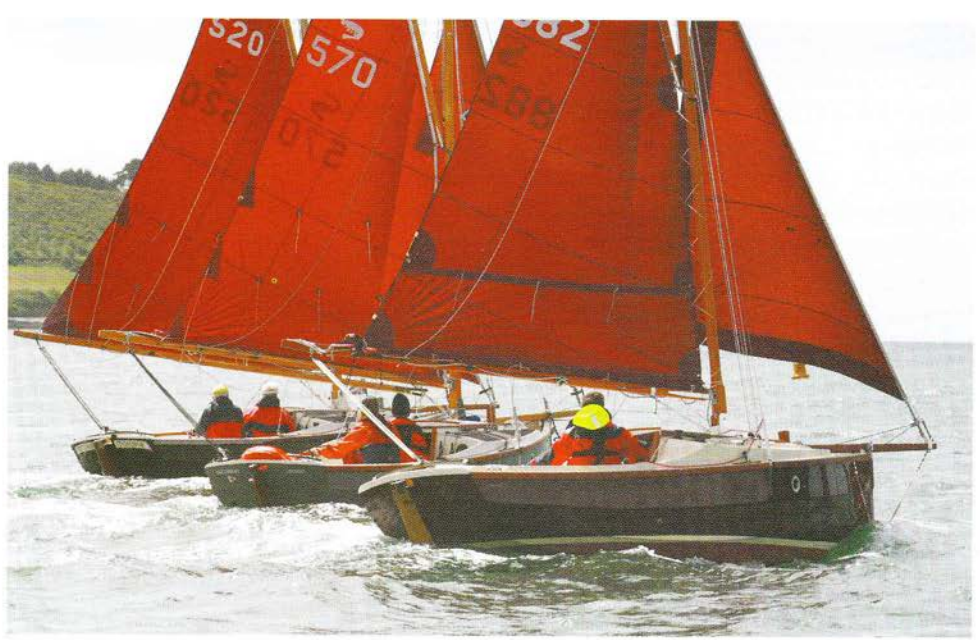
Racing during National Shrimper Week